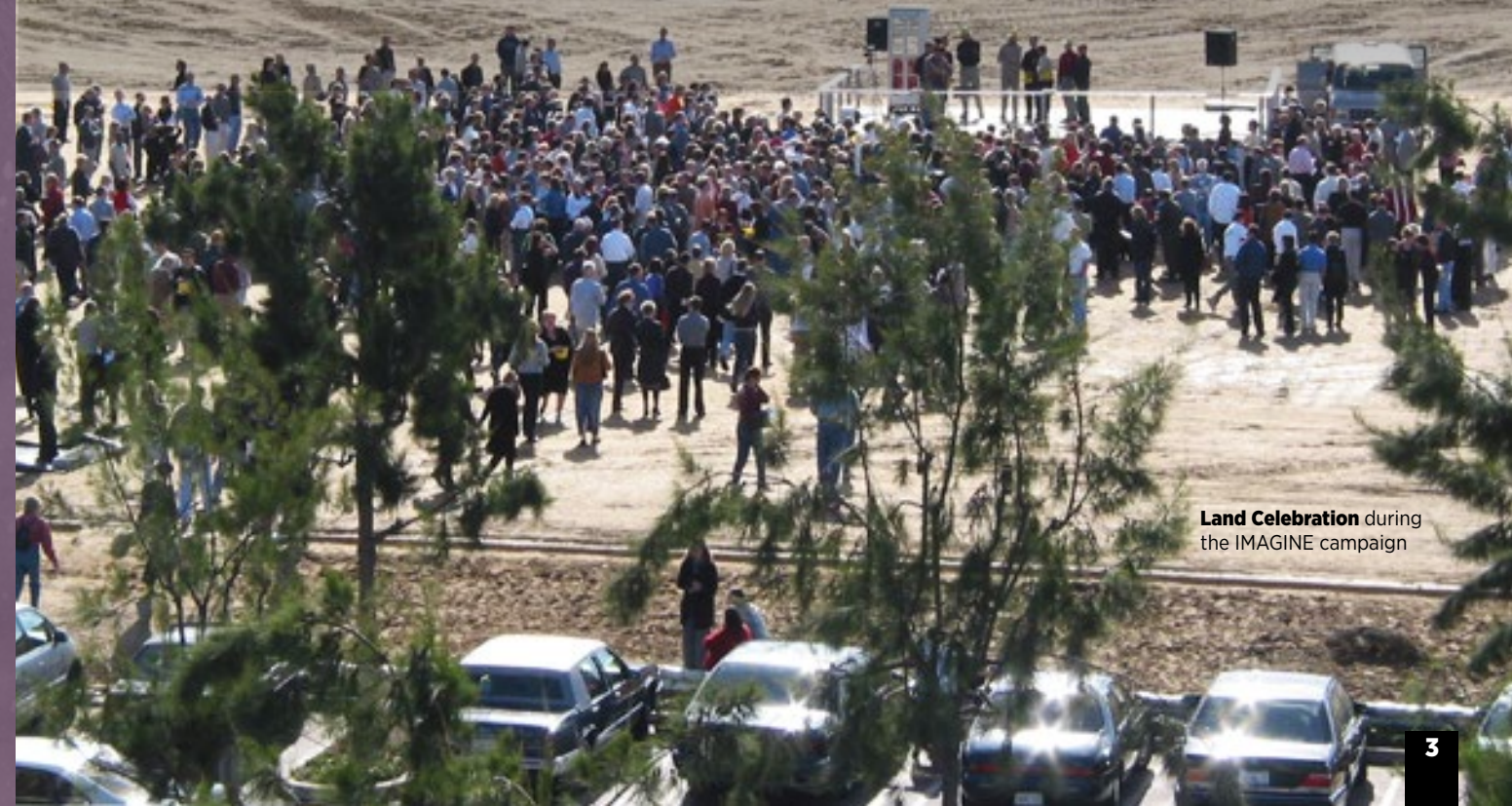
Land Celebration during the IMAGINE campaign

Through us, God continues to do more than we can imagine . Now He is calling us to go BEYOND ourselves and into this community.